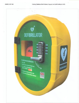
OUTDOOR STAINLESS STEEL CABINET, KEYPAD LOCK WITH HEATING & LED LIGHT